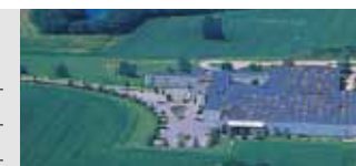
Høje Taastrup, Denmark