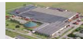
Nørre Alslev, Denmark